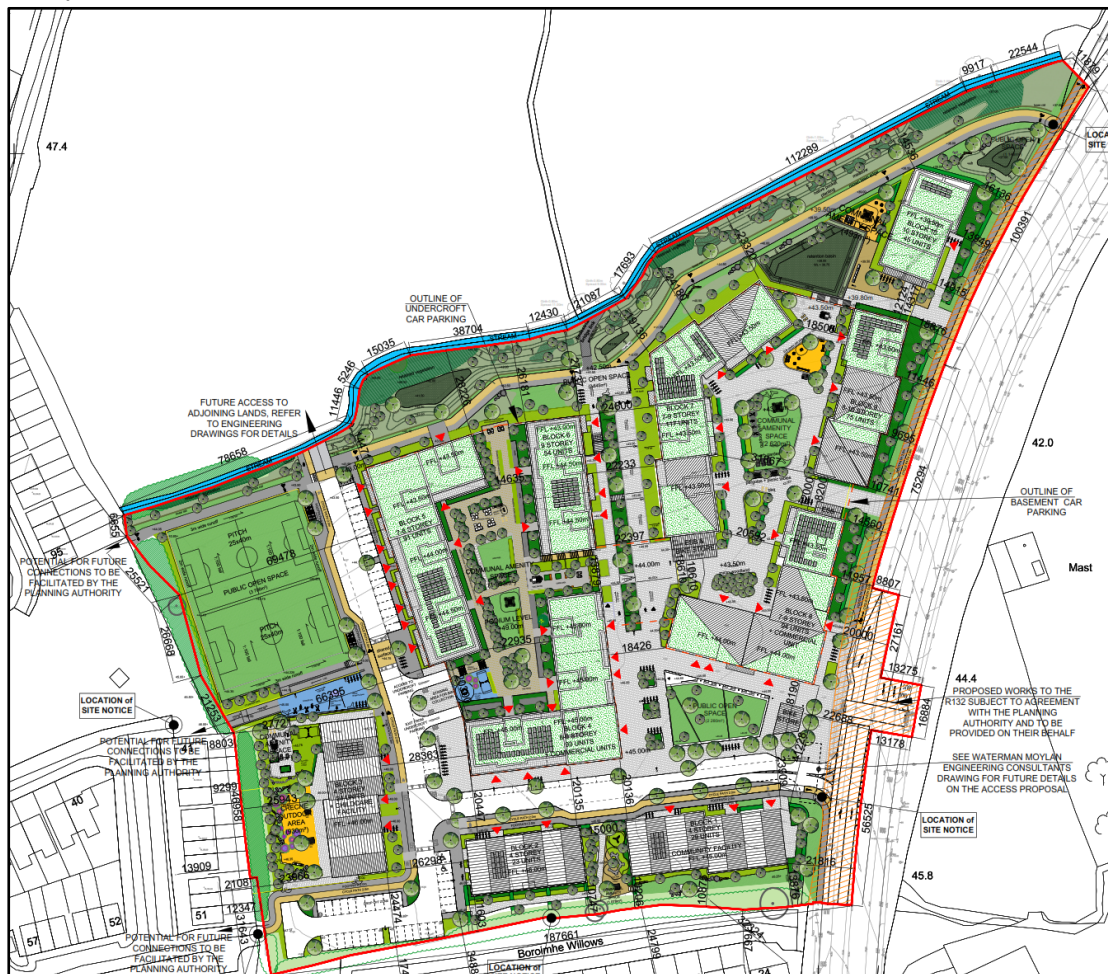
Figure 4.2 Proposed Site layout (PCOT Architects)

scale to the low-density residential dwellings with a variety in massing, concentrating the taller elements along the R132, away from the existing low density residential dwellings, whilst achieving a higher density appropriate for such locations in proximity to existing high capacity, high frequency public transport, and also proximate to further planned high quality public transport infrastructure.