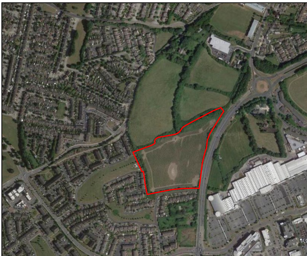
Figure 4.1 Satellite Image of the subject site (approximate location marked in red)

The site represents one of the last remaining undeveloped landbank zoned for residential use located between Swords and Dublin Airport and the city boundary. The site is also in close proximity to several employment intensive areas, including Dublin Airport and Airside Business Park.